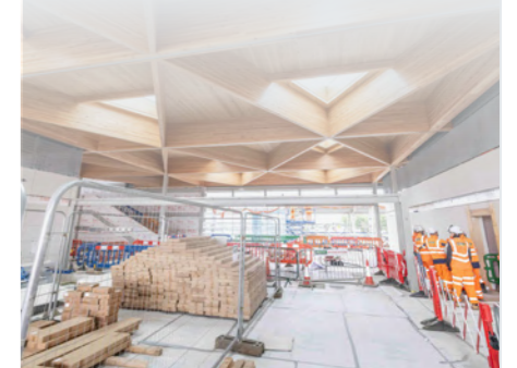
Above: Beaulieu Park Station

As always, Countryside and L&Q will aim to keep access restrictions and disruption to a minimum where practically possible and we thank residents and members of the public in advance for their patience and understanding.